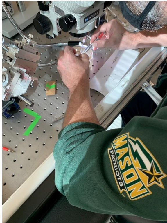
A mason alum learns to record from invertebrates during the Crawfly workshop 2022.